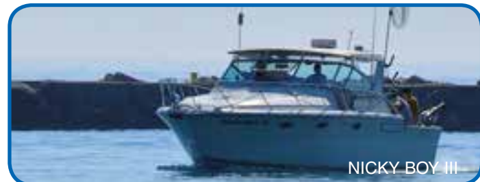
NICKY BOY III