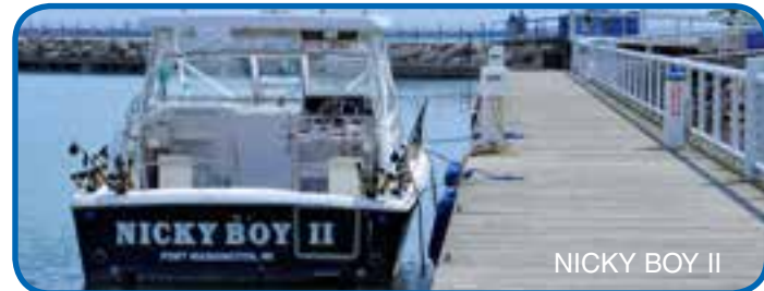
NICKY BOY II