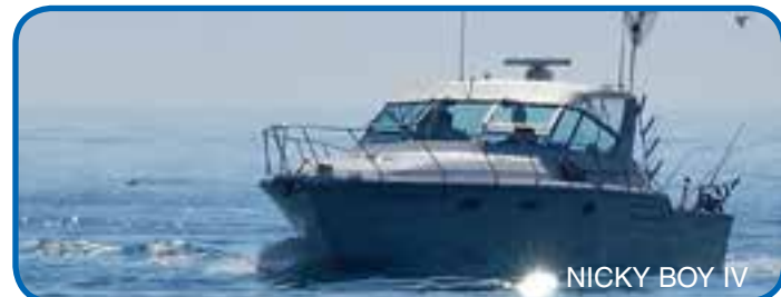
NICKY BOY IV

All of our boats are U.S. Coast Guard Certified and licensed to accommodate 1 to 6 passengers.